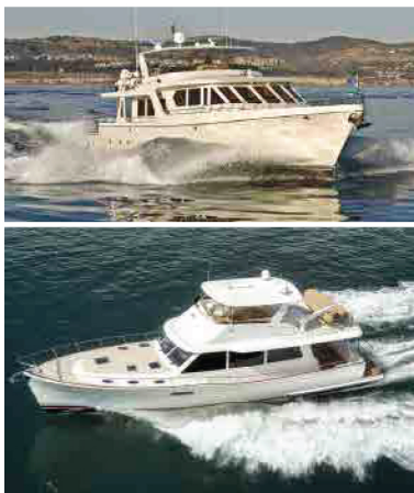
Top: Two 500XL-2X2s on the flybridge of an Offshore 80 Right: Nothing makes boating better than the comfort of STIDD seats. Two 500XLs shown aboard a Grand Banks 60.

500XL-2X2 Deluxe Low Back Admiral shown in "Chai" Fusion UltraLeather with matching powdercoat frame, medium (-2) telescoping pedestal and folding footrest in deluxe chrome and stainless.