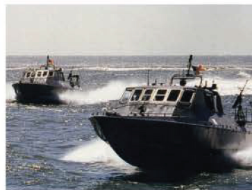
STIDD 800v53 seats - proven aboard the 82 ft. USSOCOM MkV SOC Special Operations high-performance combatant craft.