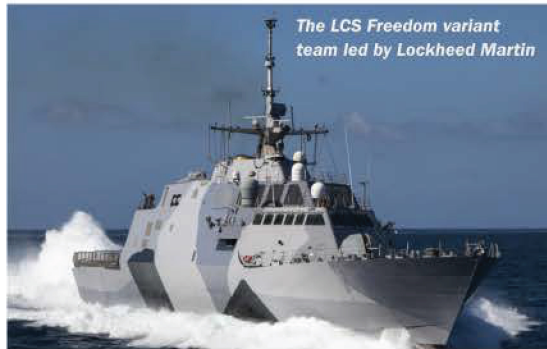
The LCS Freedom variant team led by Lockheed Martin

All STIDD Military Seats are available in your choice of STIDD finishes, fabrics and colors. For further information, contact sales@stidd.com