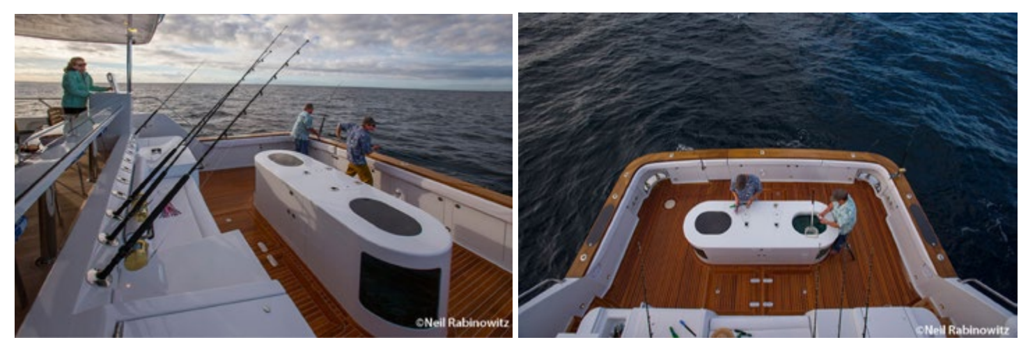
The raised aft station on the California deck overlooks the cockpit and has full controls for docking or maneuvering on a hot billfish. The teakdecked cockpit features coaming bolsters, drawer stowage for assorted tackle, and forwardfacing livewell windows so you can check on the baits at a glance.