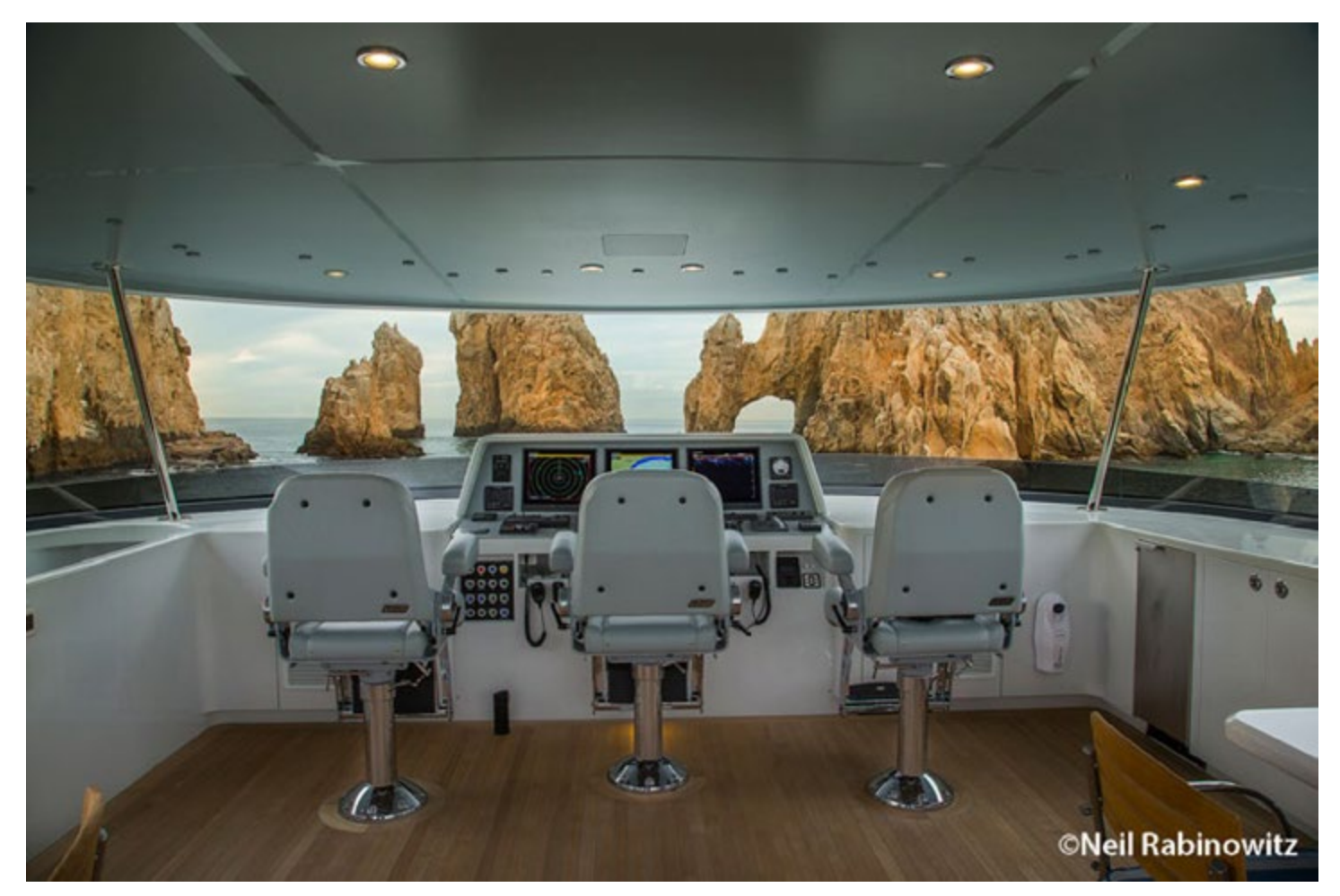
Tropical destinations are on the agenda, so the hardtop helps for allweather operation on the flying bridge. There, three STIDD helm chairs pamper their occupants during those long deck watches.