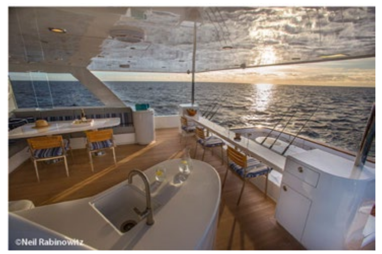
The California deck was designed so viewers could watch all the fishing action astern, while being pampered under cover by the comforts of a sprawling settee, a bar, and an entertainment area with warm teak underfoot.

Venture More has the profile of a semidisplacement yacht, reaching a top speed of 22 knots and a cruising speed of 15 knots. The upper bridge offers a skyhigh perch for spotting fish and a perfect vantage point for navigating shallow waters. Shaped and laid out by the ever practical Ed Monk, Jr., who prides himself on "never building a gallon boat in a two-quart jar," Venture More could have been bigger in design. But instead it's the perfect yacht for an adventurous globetrotting sport fisherman—making sense every step of the way, in style.