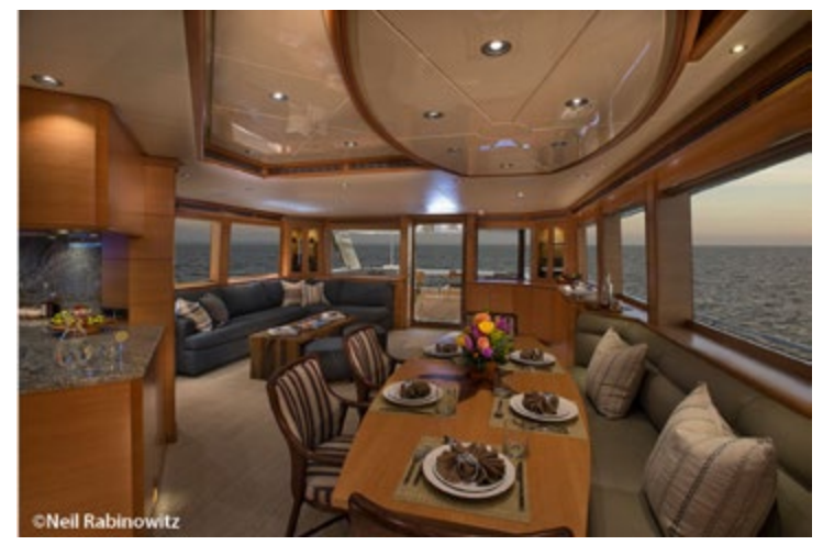
The interior is all satinfinished horizontal endgrain Anigre, in a contemporary display of joinery by Westhoff Interiors (of Kansas), which assisted Nordlund with the fabrication.

The wheelhouse has a glass bridge display teeming with stateoftheart electronics. There are three STIDD helm chairs and a spacious raised settee for enjoying the panoramic views while underway. And nothing was held back when it came to installing the latest instrumentation for fish finding, sonar, radar, systems monitoring, cameras, and more.