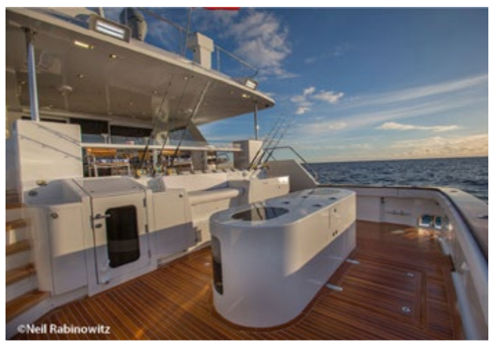
Port and starboard aft stairways lead to the fishing area, with easy engine room access and abundant rod and reel stowage plus lockers for gear. There's even a cleaning station and belowdeck fish freezers.